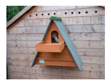
Golden Brown with shelf

An extra shelf is now available with all boxes at an additional charge. This shelf allows extra room for the owl to land and feed youngsters also a place where the young owls can come out and see the world before they leave the nest