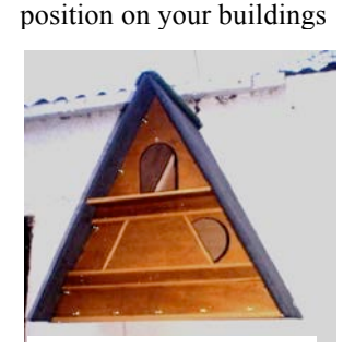
Deluxe Barn Owl Box